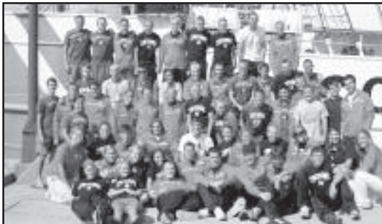
The Carthage soccer teams take an annual pre-season trip.

Oct. 31 at Illinois Wesleyan: To reach Illinois Wesleyan University in Bloomington, Ill., take I-55 south to Bloomington, Ill. Exit on Business U.S.-51 south and go past Illinois State University. Turn left on Emerson Street and cross westbound U.S.-51 to the Illinois Wesleyan campus. The Neis Soccer Field is between the Illinois Wesleyan Stadium and the hospital.