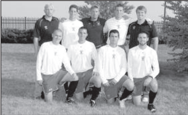
Carthage's 2007 Men's Soccer Seniors