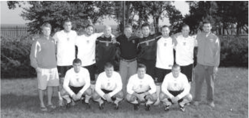
2008 Carthage Men's Soccer Seniors