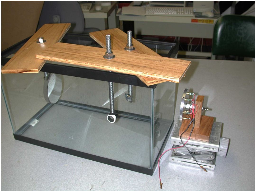
Figure 3. Top: Light path of a Newtonian reflecting telescope, as shown using the Ray Tracing demonstration system. Note that this is not a time exposure; the naked-eye image looks just like (actually better!) than this. Bottom: The setup used to produce the upper image. Note the primary and secondary mirrors, the 'eyepiece', and the laser diode array to the right.