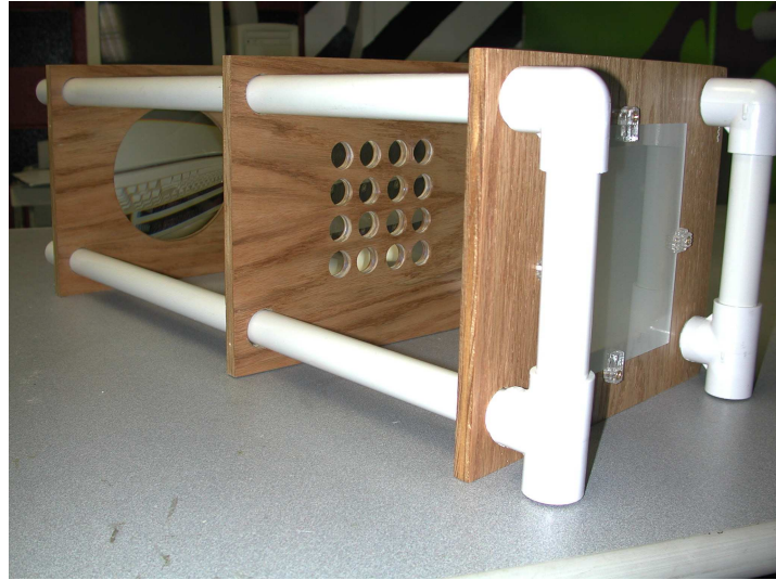
Figure 4. Left: The apparatus to demonstrate a Shack-Hartmann Wavefront sensor. The upper mirror is used merely to reflect a horizontal lightpath into the system. Right: The lens array which forms the heart of the sensor. Each samples a portion of the wavefront, projecting a displaced image on the viewing screen.