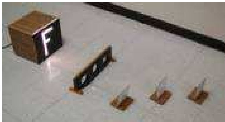
Fig. 1. The basic F-Box setup, showing the light box, lens array, and projection screens.

comparisons of different optical effects easy to observe. A reflective version could be built, as well, though the need to offset the mirrors to throw images onto suitable screens, and the substantial cost of first-surface paraboloids, casts favor in the direction of the refractive version shown here.